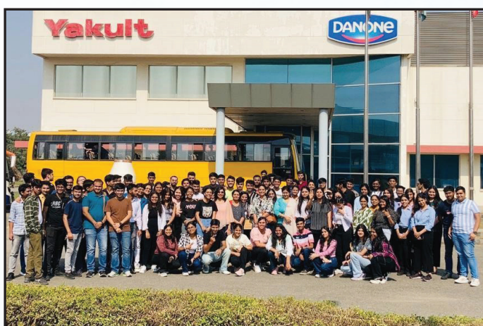
Industrial Visit to Yakult