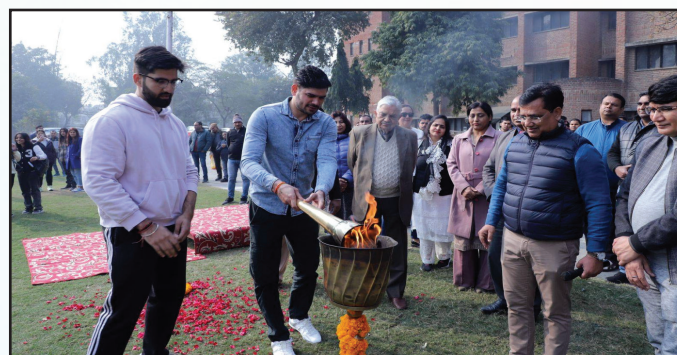
MSI Annual Sports Fest