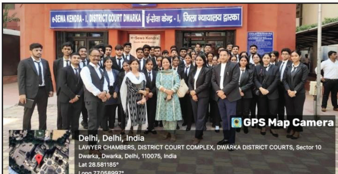
Visit of Law Students to Dwarka District Court