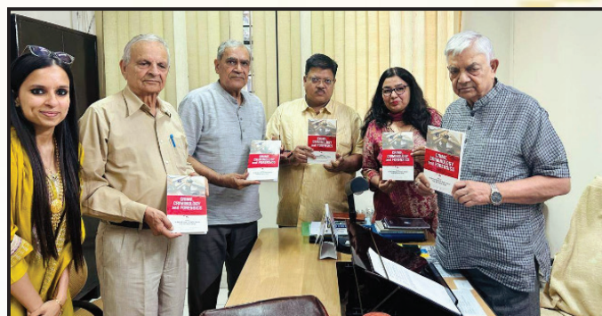
Publication of the Proceedings of National Conference on Crime, Criminology And Forensics: Rebuilding the Nations's Criminal Justice System