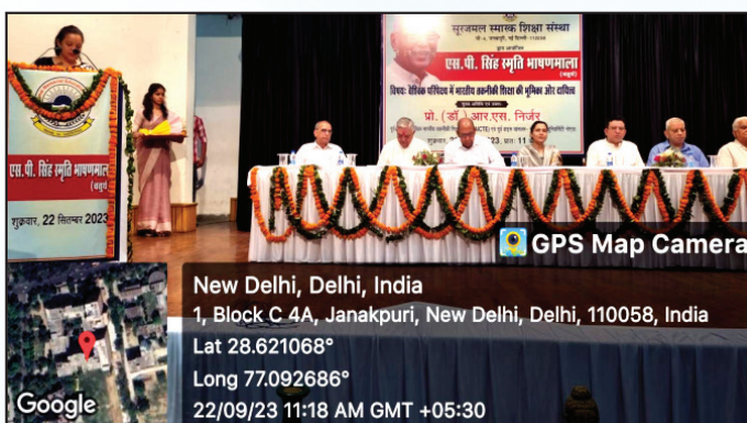
S.P. Singh Memorial Lecture (4th Series)