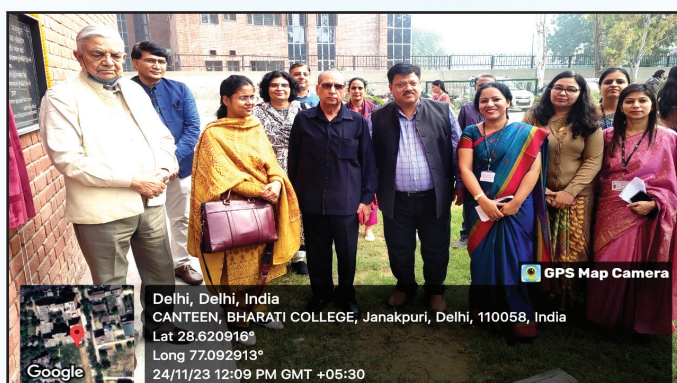
Inaugural Of Legal Aid Clinic