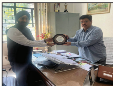
MSI receives recognition from Central Depository Services (India) Limited, Government of India for its outstanding Green Initiative efforts