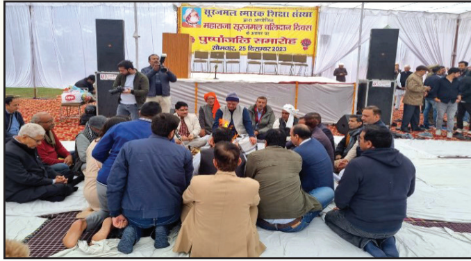
Surajmal Balidan Divas