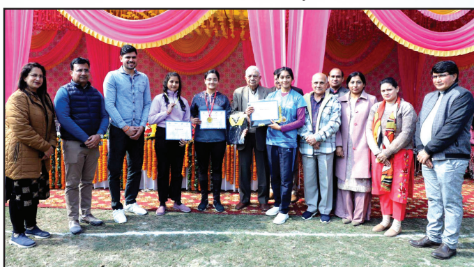
MSI Annual Sports Fest