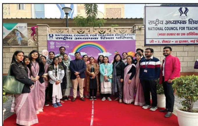
Visit of B.Ed Students to National Council for Teacher Education