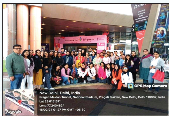
Visit to GGSIPU Health Mela